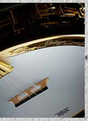
Ortega engraved armrest for ALL Banjos (ex. Uke Banjo – plain)