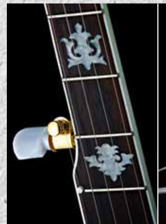
Advanced PIN position for perfect intonation! (all Ortega 5 string Banjos)

ALL BANJOS INCL. AN ORIGINAL ORTEGA DELUXE BANJO BAG!