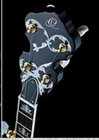
Detailed and elaborately decorated fretboards & headstocks