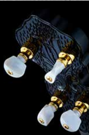
High End tuning machines produced for Ortega