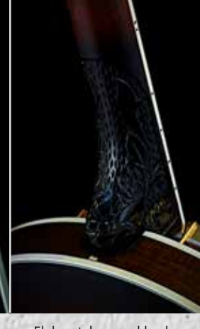
Elaborately carved heel for OBJ850-MA