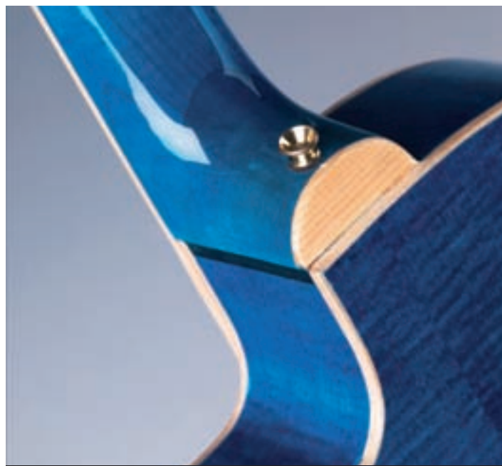
Close inspection of the RCE-1415M SBL reveals a lower quality finish than on the R-2009