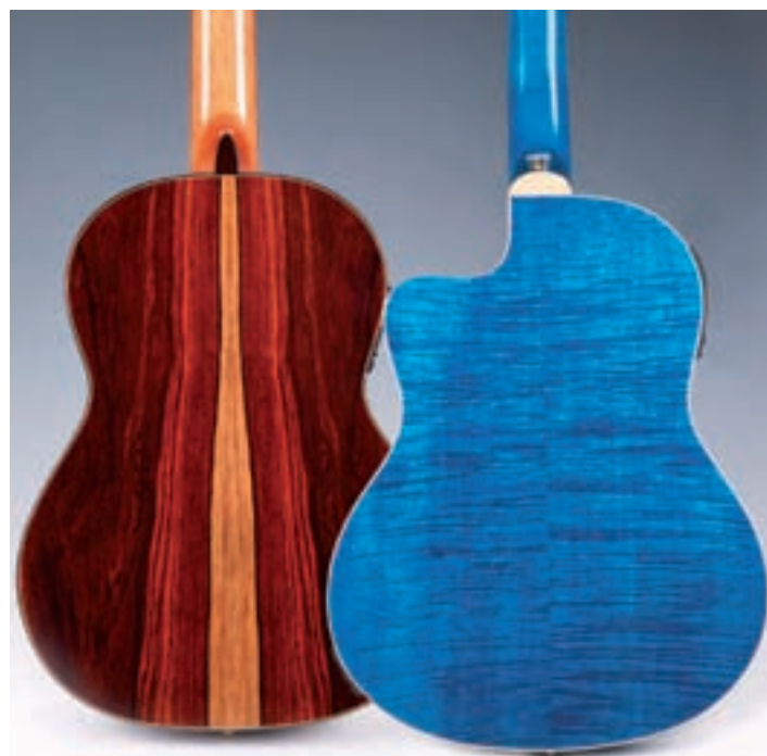
The combination of beautiful cocobolo and blue finished maple makes both guitars stand out