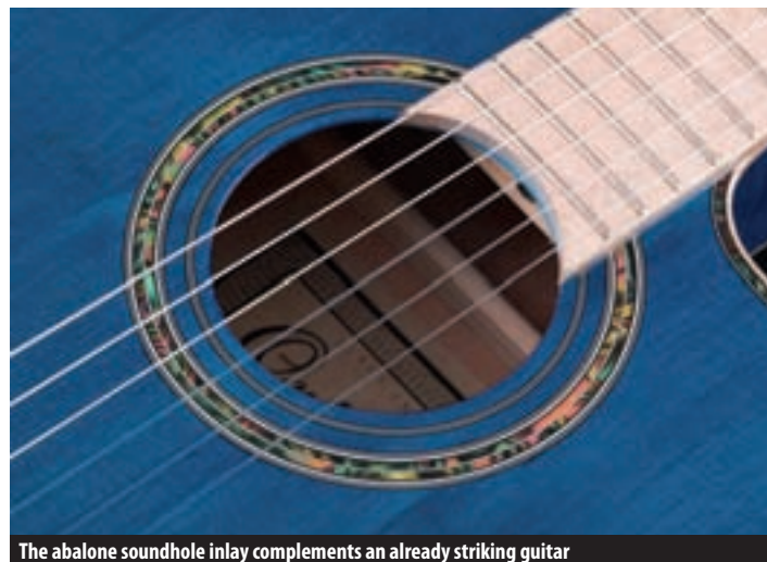
The abalone soundhole inlay complements an already striking guitar

Raking over the six strings with a more positive and even attack, the body opens in a wider and full-voiced resonating character which is thoroughly compelling, broad and quite strident.