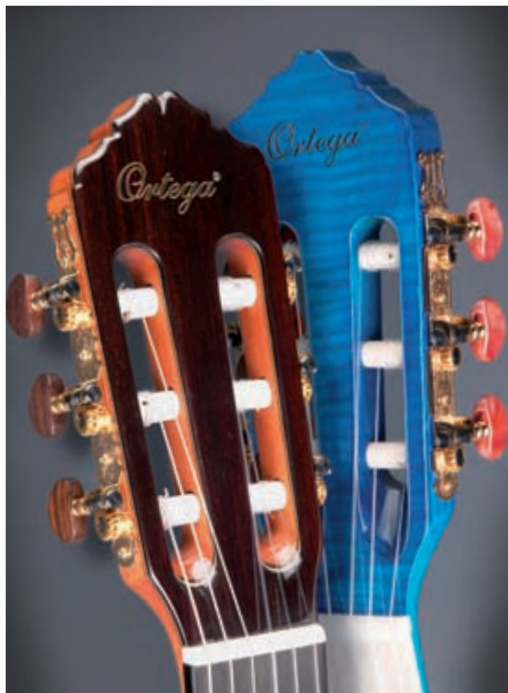
Despite modern design elsewhere, for the headstocks Ortega have opted for a traditional design

BUILD QUALITY ★★★★★ SOUND QUALITY ★★★★★ VALUE FOR MONEY ★★★★★