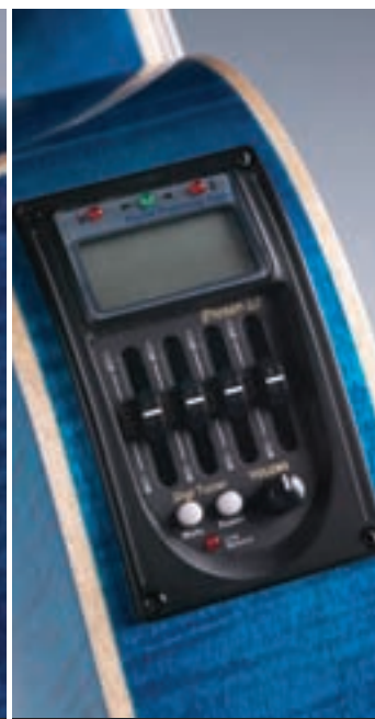
On-board digital processing tuner

Much about this guitar is very definite: the responsiveness of the machine heads, the Prener, the exacting frequency response of the maple and the overall bold look