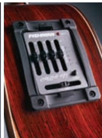
Fishman on-board electronics